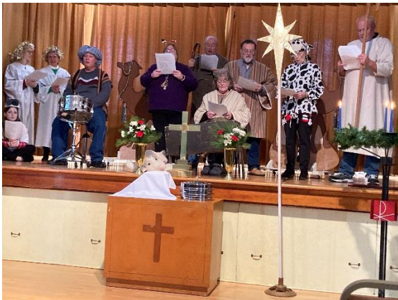
2024 Christmas Pageant